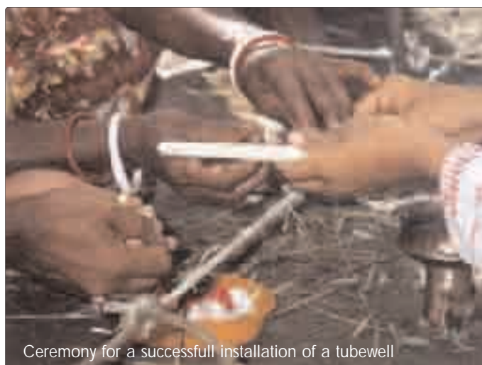
Ceremony for a successful installation of a tubewell

Development in this programme is seen as a lengthy process that has to come from within. Otherwise it will hinder disadvantaged communities in their autonomy to choose their own development path. The dynamics are strongly determined by specific local cultural, historical and social factors. At the same time important influences will come from outside involvement of various international stakeholders. The ensuing risk of this should be recognised and is portrayed in the following metaphor by Nikos Kazantzakis in Zorba the Creek.