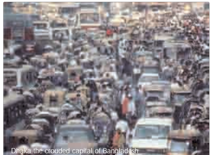
Dhaka the crowded capital of Bangladesh