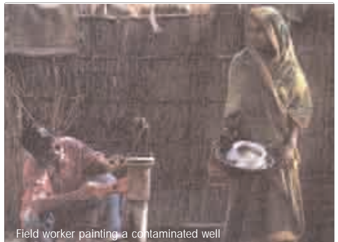
Field worker painting a contaminated well